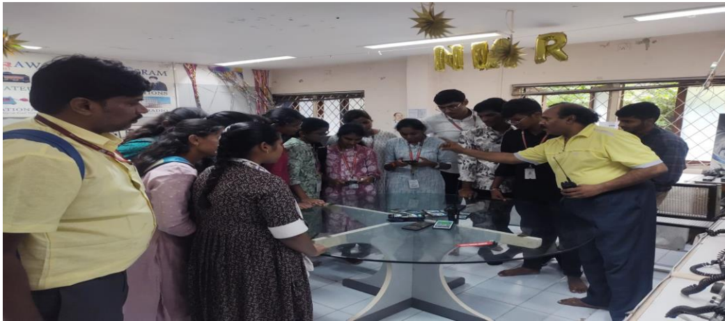
Students Industrial Visit to NIAR