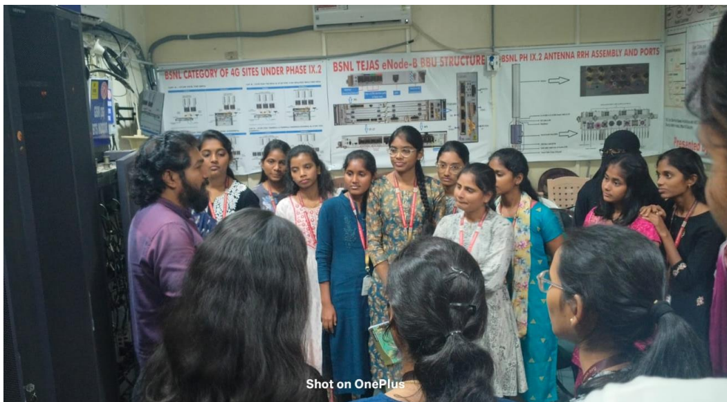
Students visit to BSNL